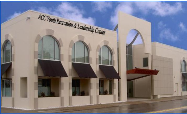
ACC Youth Recreation and Leadership Center 62 W. Seven Mile Road, Detroit, MI 48203 (313) 369-3100

Revitalizing the Seven Mile Corridor by opening the Youth Recreation and Leadership Center located at 62 W. Seven Mile Road was a much-needed facility for the area. The Youth Center provides a variety of activities and educational programs for the area youth looking to becoming contributing and responsible citizens.