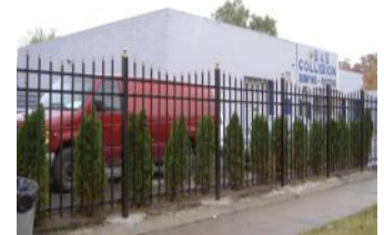
B & S Collision