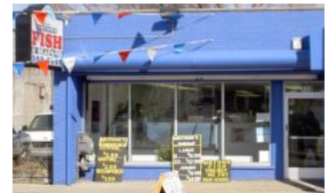
Motown Fish & Seafood