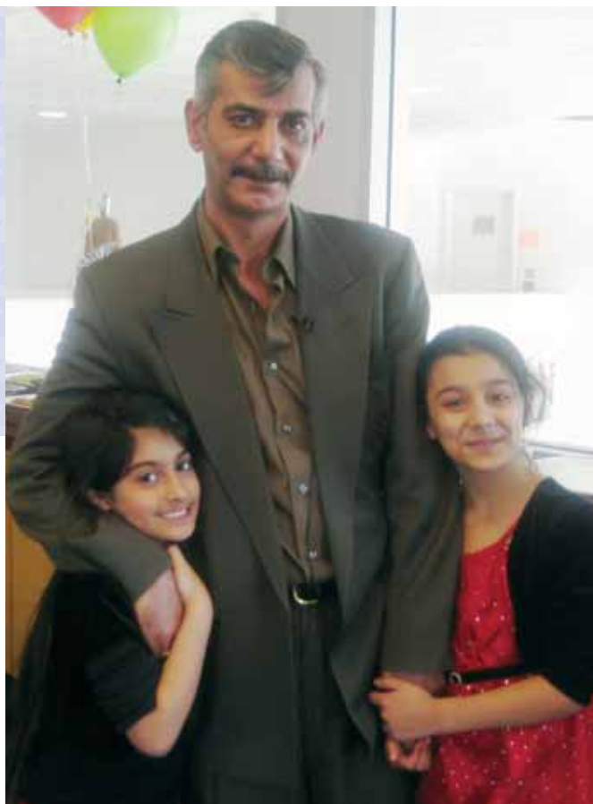
Thanks to the efforts of ACC's dedicated Behavioral Health staff a family was reunited after almost 7 years. On January 29, 2010 ACC hosted a Unification Celebration in honor of a long awaited reunion between a father and his two young daughters.