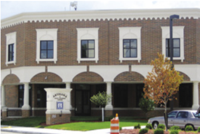
Located at 55 W Seven Mile Road, ACC's Artisana and Adult Learning Center is dedicated to cultural and social services. The center houses a gallery, café, adult education programs, classrooms, and computer lab.