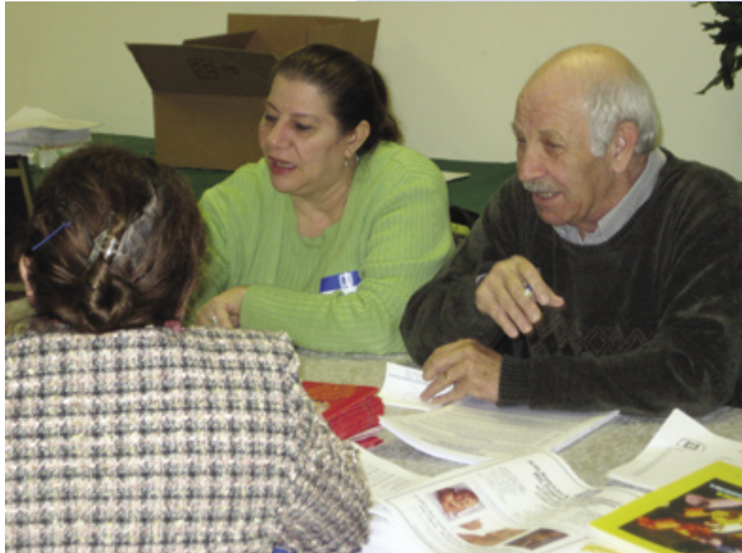
ACC-DHS program staff attend community events to provide resources and social services to Wayne, Oakland, and Macomb county residence.