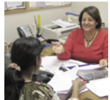
Completed in 1998, ACC's Detroit Headquarters located at 111 W Seven Mile provides a one stop shop experience. DHS services, employment and training, and health care services are among the program provided at this location.