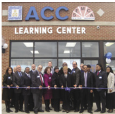
Ceremonial ribbon cutting for ACC's Hamtramck Learning Center.

ACC celebrated the official opening of its relocated Hamtramck Office on Nov. 30th. at 9019 Jos Campau. Community leaders, funders and friends came together