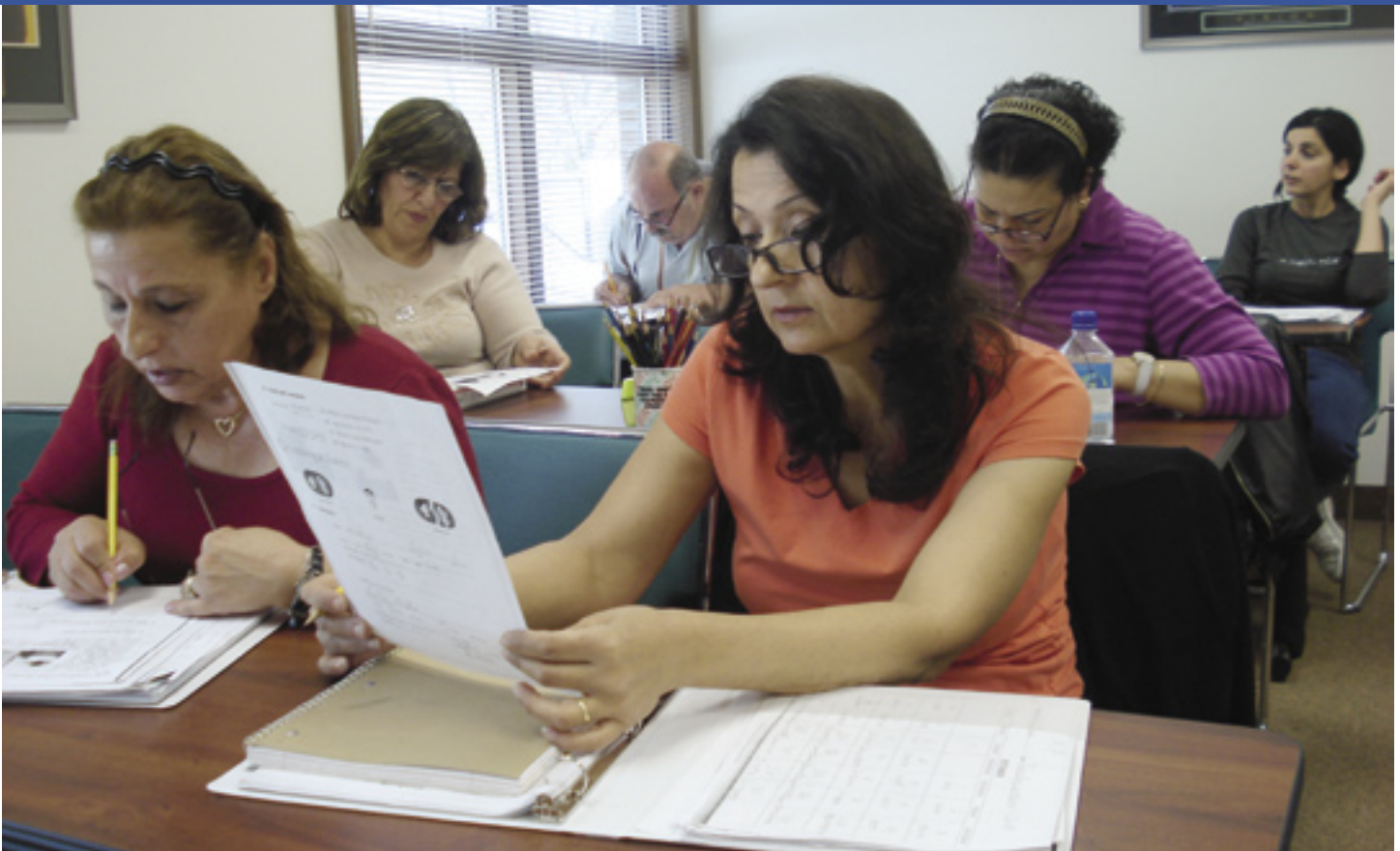
Classroom training sessions motivate participants to become an effective part of the process. Activities include training and education for personal and professional development.

Training and employment are the primary services offered by the Workforce Investment Act (WIA) Program . WIA assists individuals in learning English as a Second Language (ESL), Vocational English as a Second Language (VESL), career counseling, resume writing skills, interview skills, unemployment services