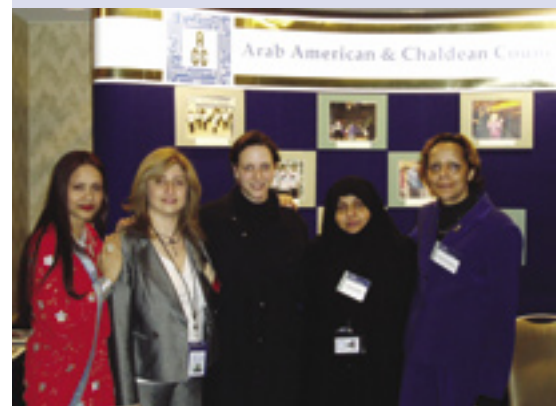
ACC's behavioral health staff and clients joined together in representing ACC at the Substance Abuse and Mental Health Services Administration (SAMHSA) Youth Conference.