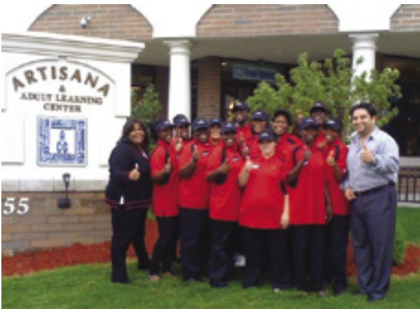
ACC's Detroit Job Education and Training (JET) Program was able to secure employment for 12 of its clients with Virgirlli Management Company/McDonald's.

The ACC SEMCA JET program implemented a new component as of October 2008 called JET Plus . This program builds on the current JET program by adding additional training and educational opportunities. ACC's JET Plus provides GED preparation and adult basic education classes, in collaboration with local educational institutions and community organizations. Funded by the Southeastern Michigan Community Alliance (SEMCA)