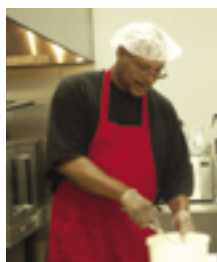
ACC's Wayne County Network Clubhouse programs focus on building client strengths, independent living skills, and assists in developing employment opportunities.