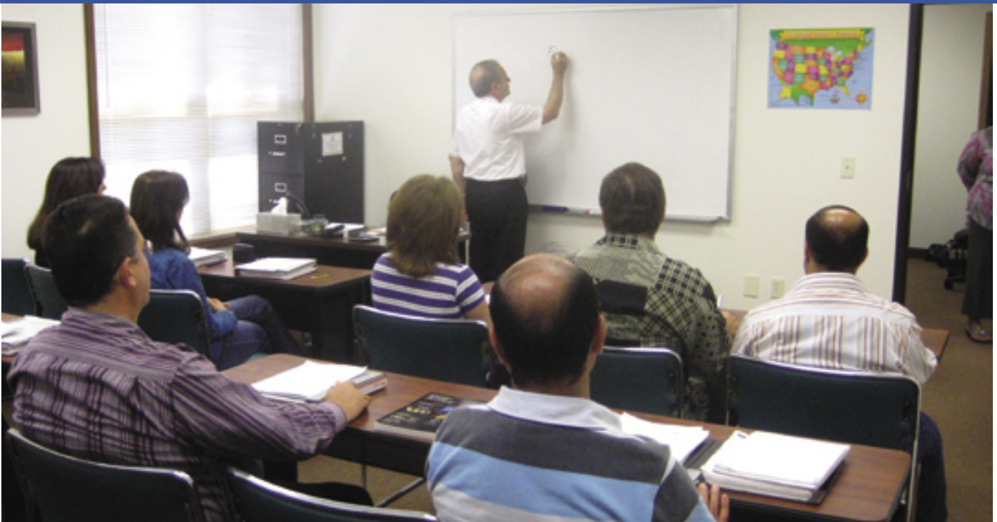
The goal of ACC's ESL services is to provide opportunities for clients to acquire the culture and language skills necessary to achieve their potential in an English speaking society. ESL programs focus on the necessary terminology and skills needed for daily survival and employment.

The purpose of the project is to help new refugees learn the necessary skills for assimilation into society, ESL, employment and training, education, and citizenship. Funded by the Community Foundation for Southeastern Michigan