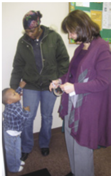
For nutritional recommendations WIC specialists measure height and weight to assess a child's growth development and provide hemoglobin tests to check iron levels.

WIC is a health and nutrition program that has demonstrated a positive effect on pregnancy outcomes, child growth and development. Funded by the Detroit Department of Health and Wellness Promotion and the Wayne County Department of Public Health