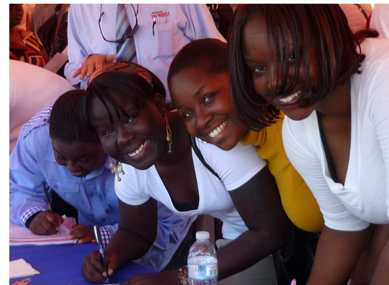
PUBLIC HEALTH PROGRAMS AND BEHAVIORAL HEALTH PROGRAMS