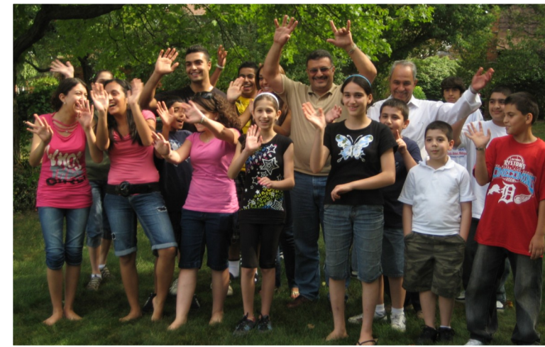
YOUTH PROGRAMS AND SERVICES

WIC Program - Wayne County 138 Cortland, Highland Park, 48203 (313) 865-4631 ext. 299