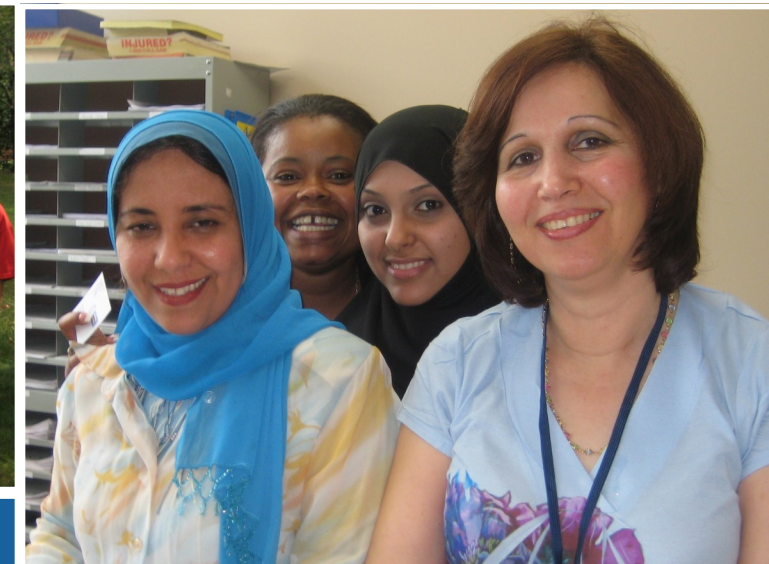
EMPLOYMENT AND TRAINING PROGRAMS SOCIAL SERVICES - DHS COMMUNITY OUTREACH PROGRAMS