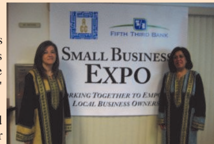
(Above) The morning kicked off with a "Taste of ACC" continental breakfast and networking session.

ACC clients and community members boarded the e-Bus where they were provided with community resources along with information regarding banking and their credit report. After the e-Bus, participants visited the Detroit Community Health Connection, which provided free health screenings. Clients also had the option of participating in two workshops "Banking Basics 101" and "Taking a Business From Your Basement to the Consumer."