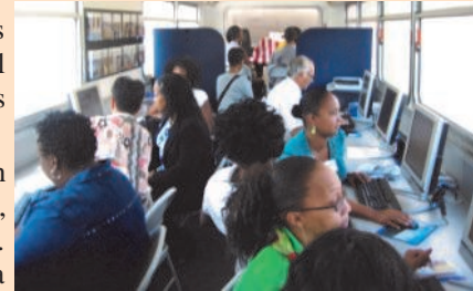
The E-Bus includes information from DTE, Michigan DHS, to a list of low-income housing, to how to prevent identity theft, and more.