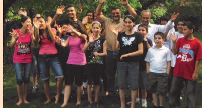
ACC Oak Park Youth Stay In School Program

I had the best experience in the afterschool program. When I went there my English was not all that good. The teachers helped me build my English. We do math, reading, writing, spelling, gym and relaxing activities. In the summer we learn and have fun at the same time because we have the best teachers ever. I had learned a lot of things in the afterschool and summer program. I am so thankful to this program, to the teachers, and the people in charge. I hope that this program will stay forever because there is a lot of people that need it.