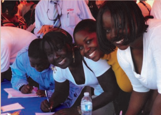
"I really appreciated it," said participants about the ACC opening up an opportunity for all in the community.

The goal of ACC's annual job fair is to provide participants with results that will allow them to obtain employment and sustain them and their families.